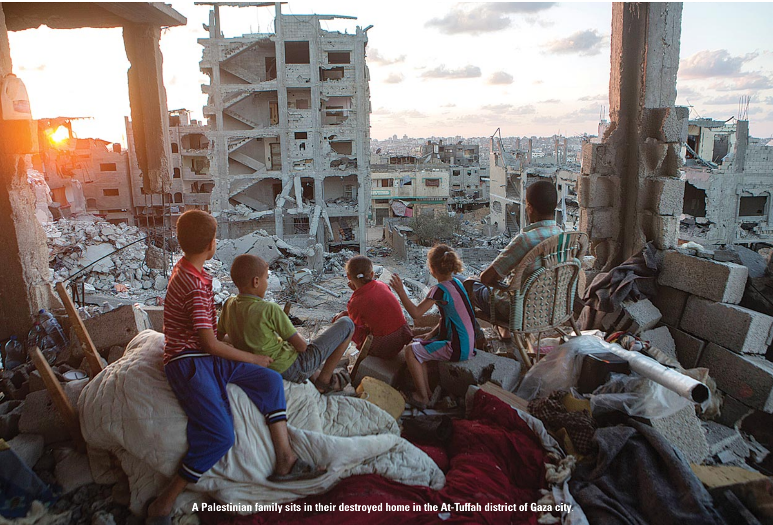
A Palestinian family sits in their destroyed home in the At-Tuffah district of Gaza city.