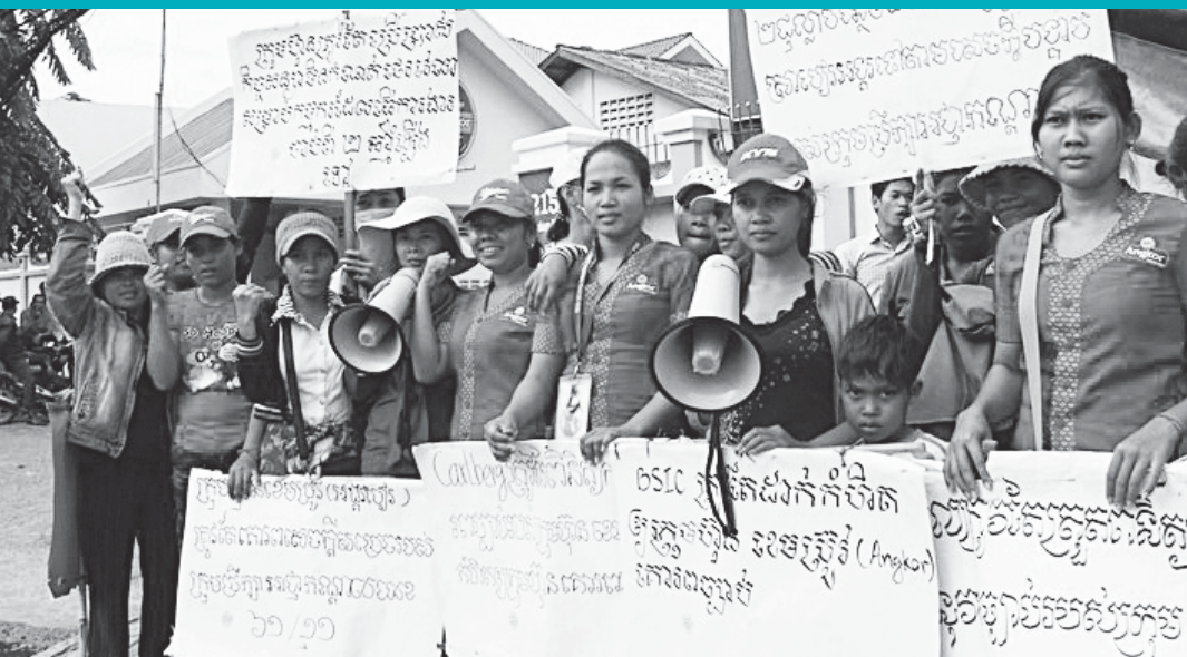
With support from Union Aid Abroad-APHEDA, the CFSWF has won new laws giving its members, like these beer promotion workers, the same rights as other Cambodian workers.