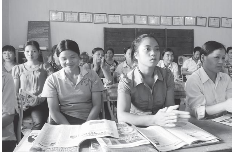
Left: Villagers in Nà Ròong, Vietnam, put on plays to raise awareness on domestic violence. Theatre can be a very good tool to communicate a difficult messages to wide audiences who may not otherwise feel comfortable discussing this issue. Right: Women’s sharing clubs in Vietnam provide a safe place for women to share information about situations of domestic violence, as well as receive information on domestic violence prevention.