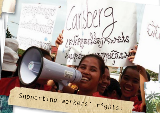
Supporting workers' rights.