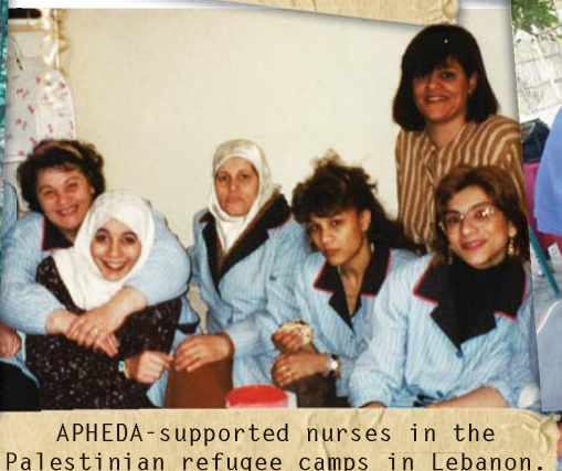
APHEDA-supported nurses in the Palestinian refugee camps in Lebanon.