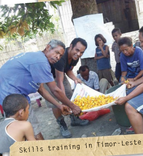
Skills training in Timor-Leste.