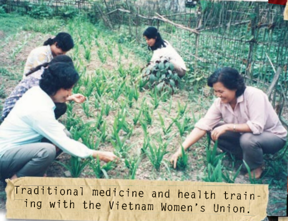
Traditional medicine and health training with the Vietnam Women's Union.