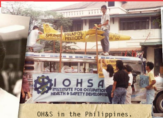
OH&S in the Philippines.