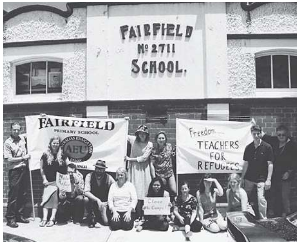
Teachers around the country protest our refugee policy on International Human Rights Day.

Protests in support of people held in Australian detention centres are not limited to the QTU. The