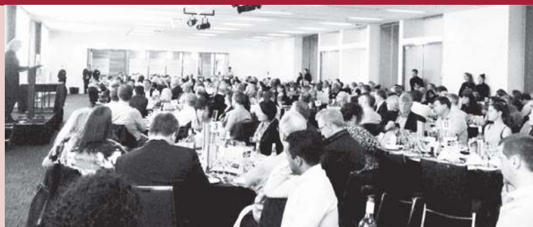
A packed house at the Sydney Gala Dinner listens to the keynote address from federal member for Fremantle, Melissa Parke MP.

In 2015, Australian union members and communities responded to several humanitarian disasters by donating generously to APHEDA emergency appeals. After the devastation wrought in Vanuatu by Cyclone Pam, more than $100,000 was raised to support long-term reconstruction. Similarly, we received over $200,000 dollars to support Nepal's reconstruction after the massive earthquake in April. We also linked up with UNI Global, a global union federation to raise over $100,000 for Nepal, from UNI affiliates around the world.