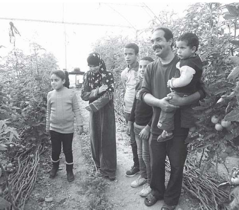
Greenhouse food production in the West Bank.

Union Aid Abroad-APHEDA's food security projects in Gaza and in the West Bank have focused on environmental protection, organic low-input methods as well as efficient rainwater harvesting.