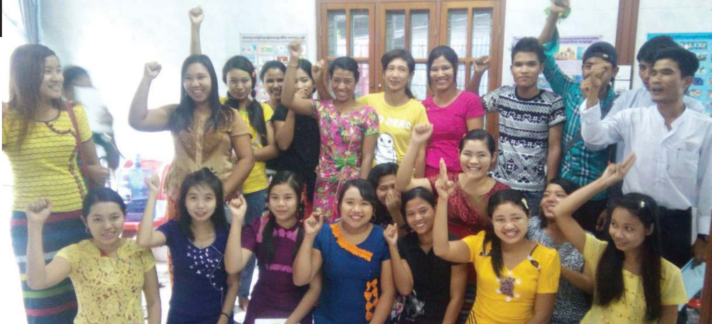
Union activists from garment factories in North Oukkalarpa Township, near Myanmar's capital Yangon, complete their worker representative training with Union Aid Abroad-APHEDA partner organisation, Action Labor Rights.