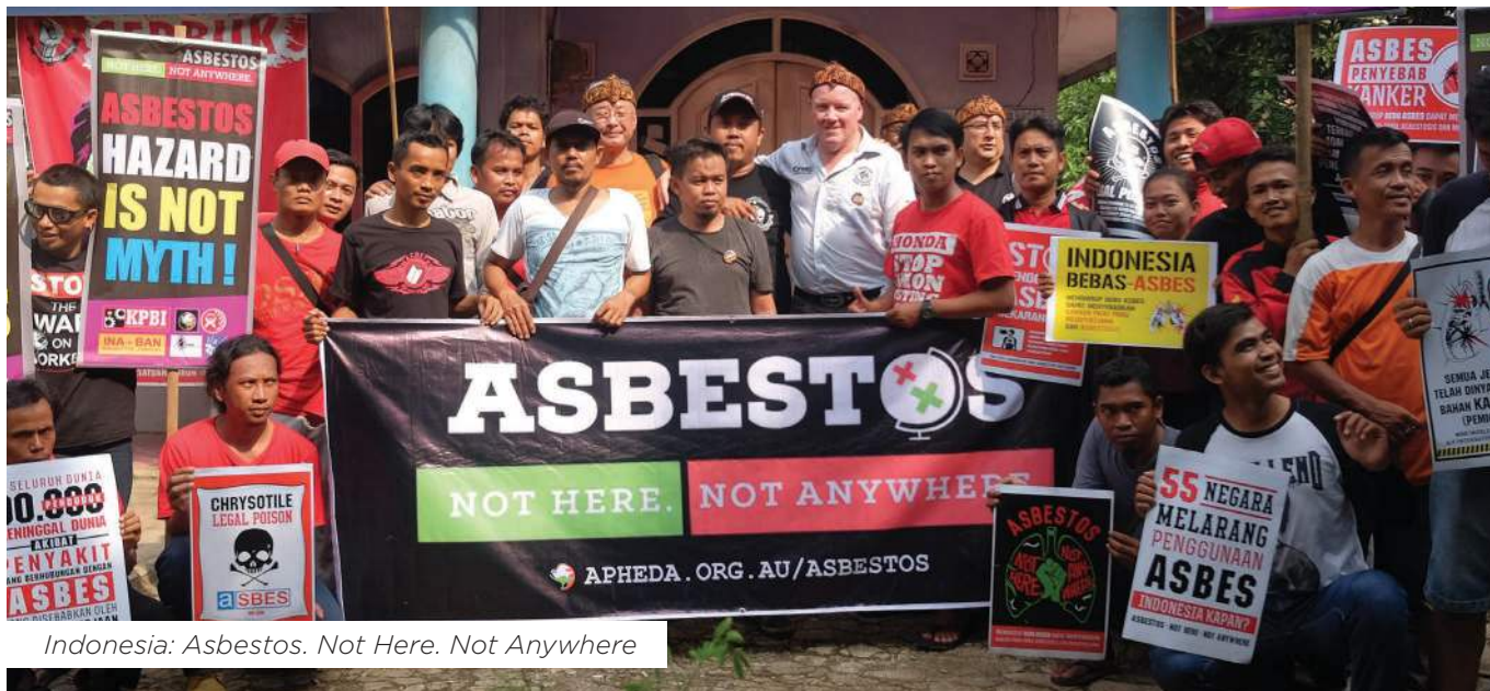
Indonesia: Asbestos. Not Here. Not Anywhere