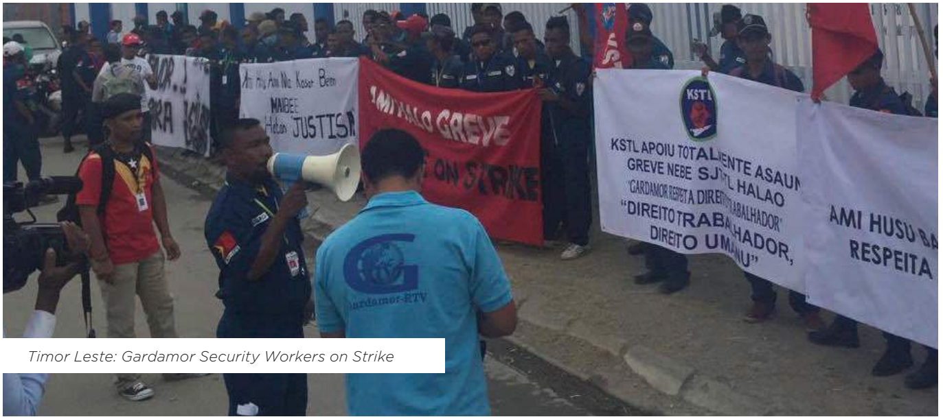
Timor Leste: Gardamor Security Workers on Strike