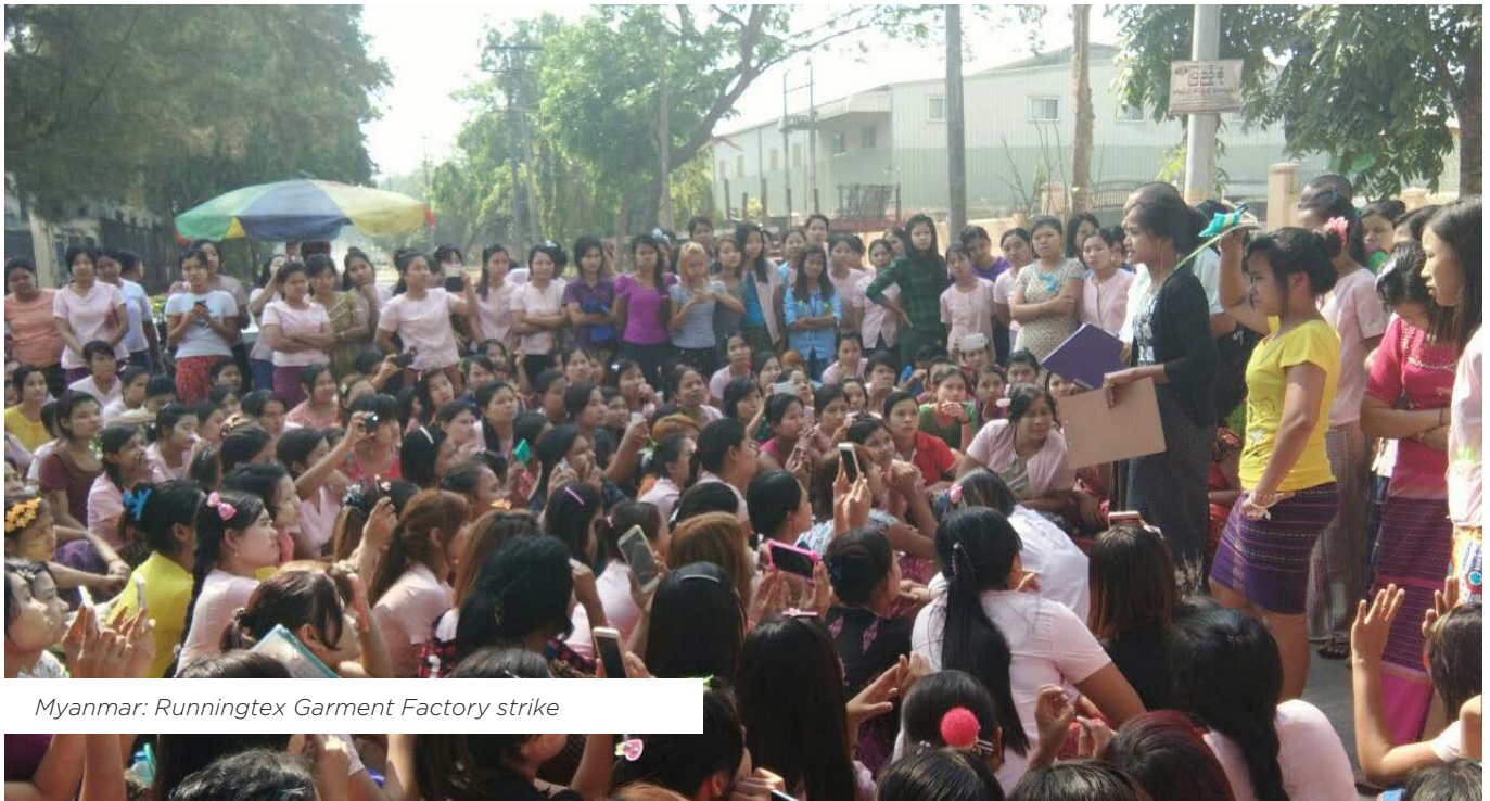
Myanmar: Runningtex Garment Factory strike