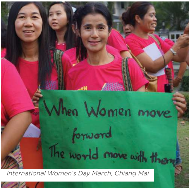
International Women's Day March, Chiang Mai

Increasingly we in Australia are inter-linked with countries of the Global South through the crises generated through the severity of climate change, the reach of global capitalism and the refugee impact of conflict and war. Our union solidarity must envisage new ways to confront the impacts of a more-globalised world.