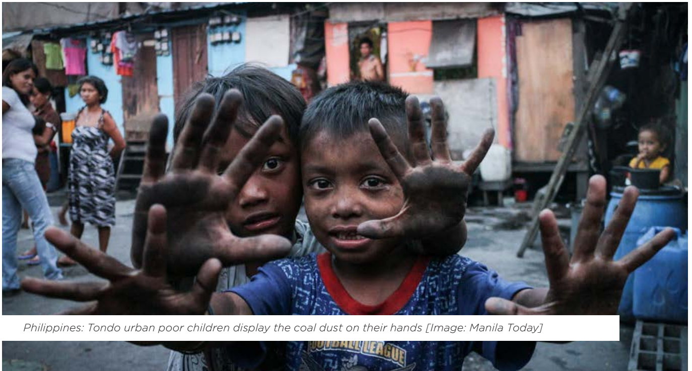
Philippines: Tondo urban poor children display the coal dust on their hands