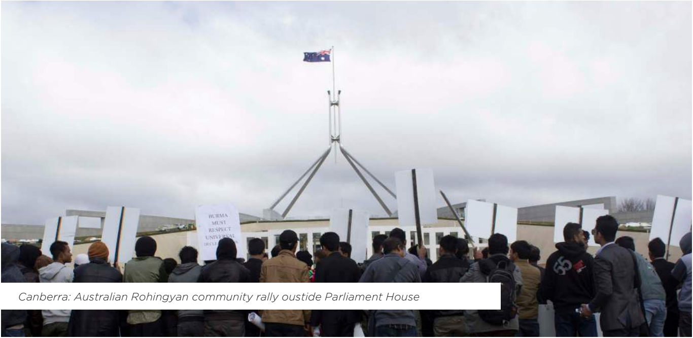
Canberra: Australian Rohingya community rally outside Parliament House