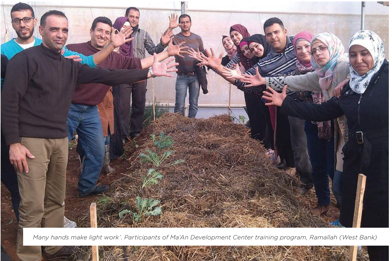
Many hands make light work'. Participants of Ma'An Development Center training program, Ramallah (West Bank)

Level 3, 377-383 Sussex St Sydney NSW 2000 Australia Phone: (02) 9264 9343 Email: office@apheda.org.au