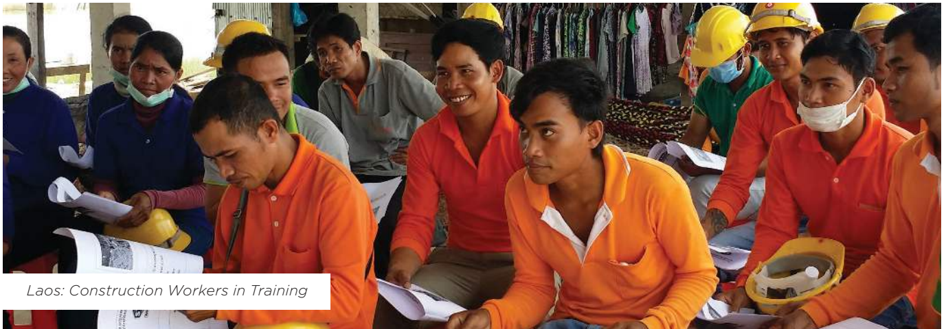
Laos: Construction Workers in Training