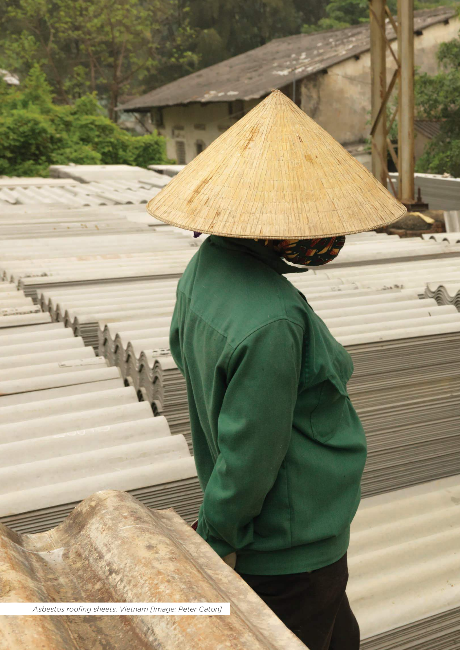
Asbestos roofing sheets, Vietnam